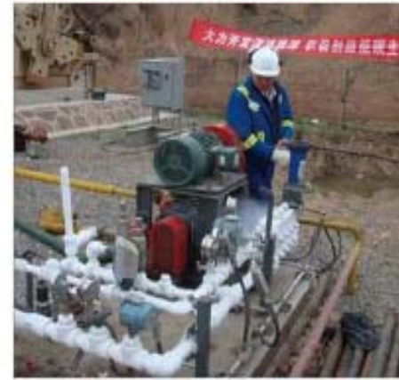
CUCBM CO 2 -ECBM Well Site

Project Entity: China United Coalbed Methane Company