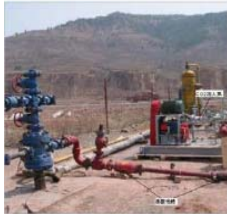
CUCBM CO 2 -ECBM Well Site