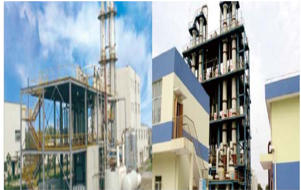
10,000 ton loop reactor

Jiangsu Jinlong-CAS Chemical Co., Ltd. has built a production line to produce 22,000 tons of CO 2 -based poly(propylene(ethylene) carbonate) annually from CO 2 captured from ethanol plants and can be used to produce highly flame-retardant exterior wall insulation material, leather slurry, biodegradable plastics, etc. This project will use about 8,000 tons of CO 2 per year .