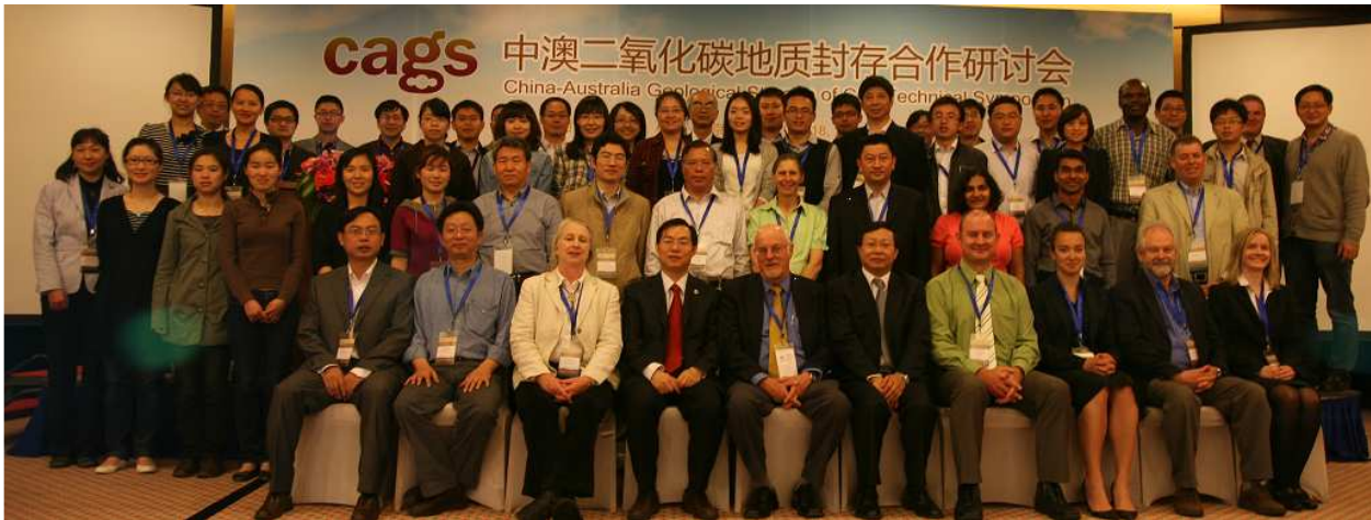
CAGS I Final Technical Symposium, Beijing, April 2012

The achievements of CAGS1 have been recognised by the Australian and Chinese governments and the project has been extended to the second phase (CAGS2) for two years from July 2012 to June 2014. CAGS2 has been awarded funding of A$1.39 million from the Australia-China Joint Coordination Group on Clean Coal Technology (JCG) to build on the success of CAGS1 and will focus on three core programs—Research Projects, Workshops and Schools, and Visiting Fellowships.